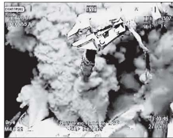
A robotic arm controlled by BP technicians attempts to stop the flow of oil from the main leak. This attempt, like so many others, failed. BP